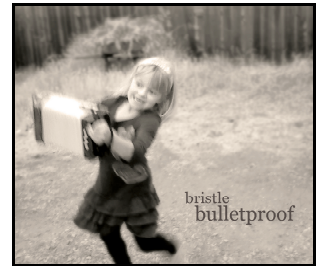
Bulletproof (Edgetone 2010)